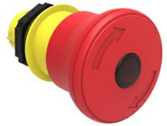
Illuminated mushroom head button actuators - For emergency stopping LPCBL66